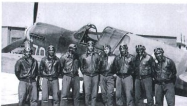
The Tuskegee airmen up and famous boxer Mohammad Ali bottom.

During world war 2 the Tuskegee airmen were the first black airman to fight in world war 2. Almost 1,000 Black men were trained at the Tuskegee army air field.