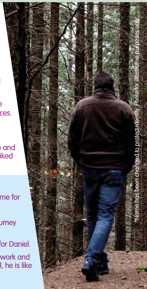
*Name has been changed to protect identity. Photo for illustrative purposes only.