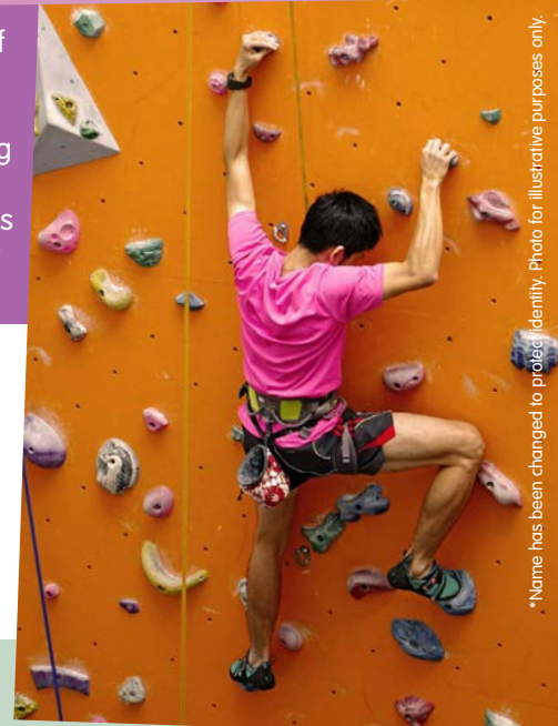
*Name has been changed to protect identity. Photo for illustrative purposes only.