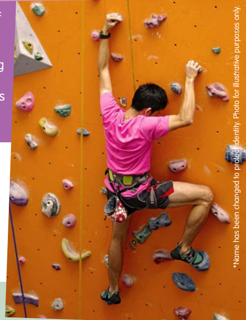
*Name has been changed to protect identity. Photo for illustrative purposes only.