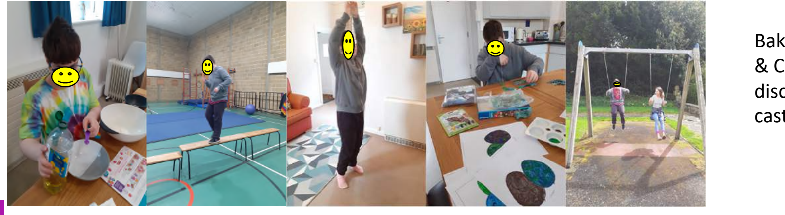
Baking, Gym, Yoga, Arts & Crafts, Swings, Easter disco, Swimming, Bouncy castle & Puzzles!