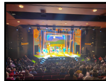
TFS visited the pantomime!