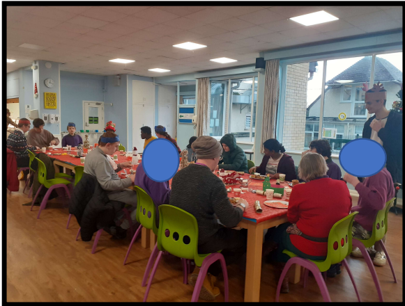
Christmas dinner 2023