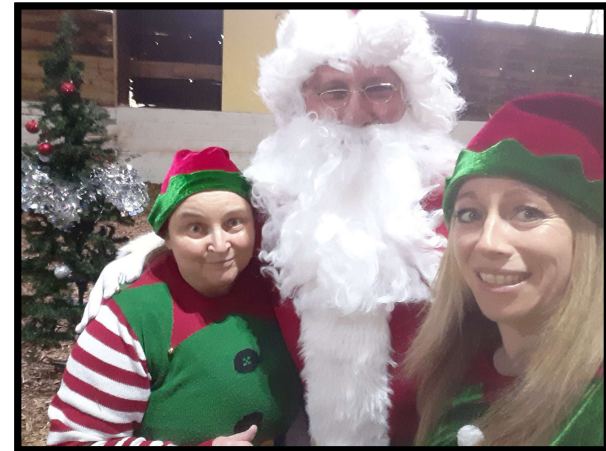
Santa visits TFS!