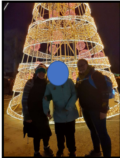
Festival of lights