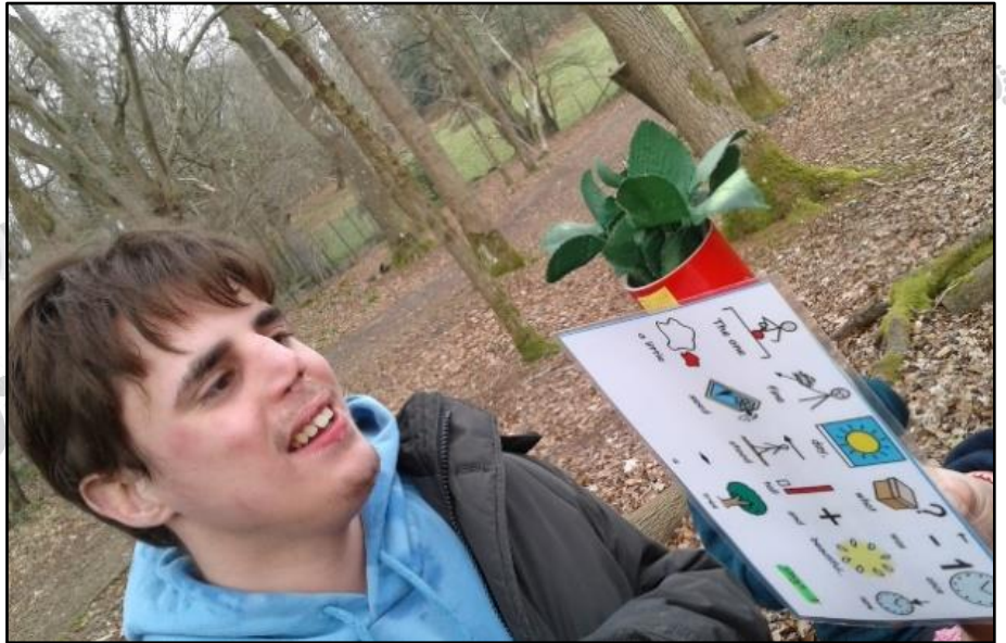
"The Little Seed"