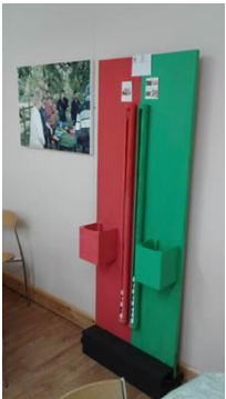
The Red and Green Voting Machine!

Students have recently created a voting machine in their DT lessons where they are able to slot some balls into tubes in order to vote for their favourite food. This is proving to be a clear visual way of consulting the students on what they enjoy eating and what food they would like to have more often.